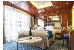
Main Deck Suite