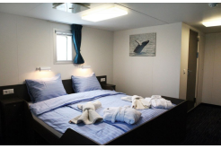
Triples Porthole Twin Porthole