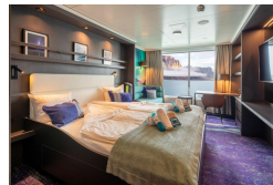
Quadruple Porthole Superior