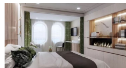
Oceanview M4 - waitlist