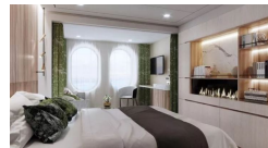
Oceanview M4 - waitlist