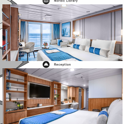
Category D Stateroom - Albatros State