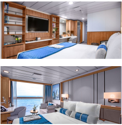
Category E Stateroom - French