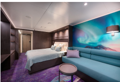
Triple Porthole Twin Porthole