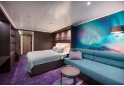
Triple Porthole Twin Deluxe Twin Porthole Twin Window