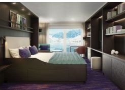
Quadruple Porthole Superior