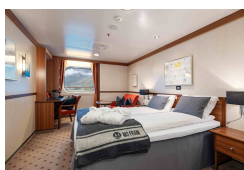
Arctic Superior. Small