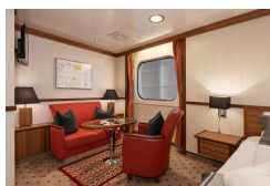
Arctic Superior medium