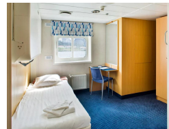
Twin cabin. From