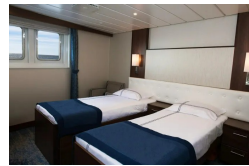
Lower Deck Twin