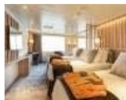
Owner's Suite Solo Panorama