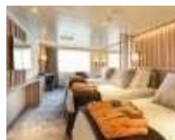
Deluxe Balcony Suite