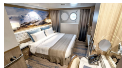
Balcony Stateroom - A