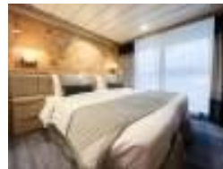
Deluxe Veranda Forward Stateroom