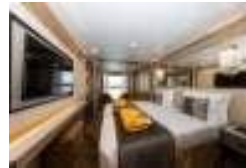
Deluxe Veranda Forward