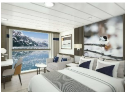
Aurora Stateroom Superior Single