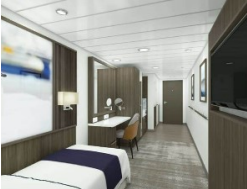
Aurora Stateroom Triple