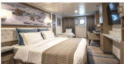
Aurora Stateroom Twin