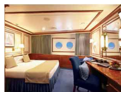
Category 1. From