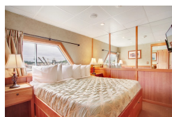
Jr Commodore Cabin