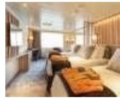
Owner's Suite Solo Panorama