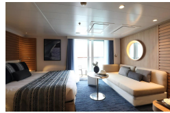
Deluxe Suite Deck 5