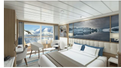
Balcony Stateroom Category C