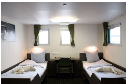
Twin Porthole Twin Window