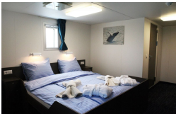
Triple Porthole Twin Deluxe