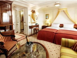
Category C. From