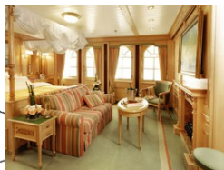
Category A: Suites with balcony. From