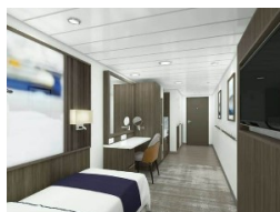
Aurora Stateroom Triple