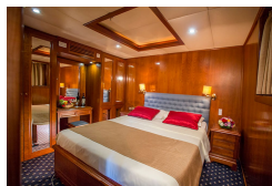
Category A USA ~ Price