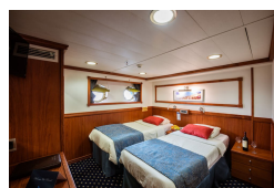
Category C USA price