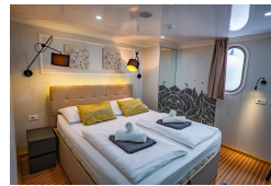
Above Deck Cabin