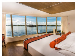
Deluxe Master Suite