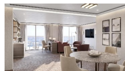
Grand 1 Bedroom