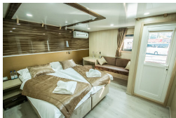
Upper Deck VIP Cabin with balcony