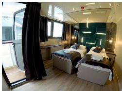
Upper deck balcony cabin