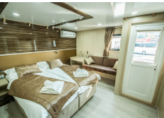
One upper deck cabin