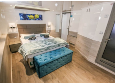
Main or upper deck cabins