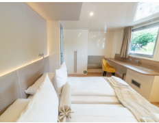
VIP upper deck cabin