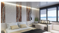
VIP Cabin (Upper Deck)