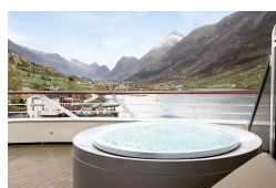
Prestige Stateroom Deck 4