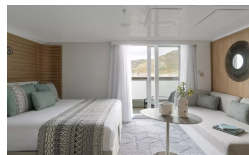
Grand Deluxe Suite