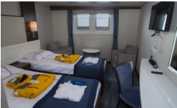
Lower Deck Twin