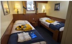
Lower Deck Twin. From