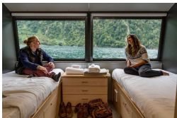
Governor Suite Executive King