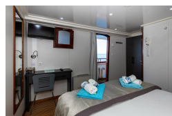
Main Deck onboard Prestige