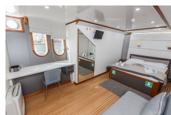
Upper Deck Twin cabin onboard Prestige