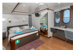
Upper Deck Twin onboard Prestige