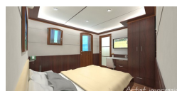
Main Deck Cabin - Twin Cabins