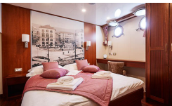
Above deck Cabins - From