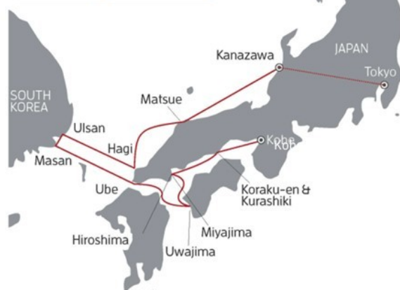
Cruise Expedition Map

Uncover the true essence of The Land of the Rising Sun on this land and sea adventure, as we experience medieval castles and temples, magical gardens, beautiful landscapes, and discover a strong cultural history. Our explorations take us beyond well-known highlights to remote the coastline, islands and pockets tourists rarely have the opportunity to experience, while also venturing across to South Korea. A country rich in history and tradition, Japan seamlessly blends ancient customs with ultramodern living which we will experience as we make our way from iconic cities to remote towns and cultural centres. Our intended destinations are designed to showcase contemporary cities and modern museums alongside medieval castles and shrines from the Edo period, culturally rich islands and fascinating wilderness and wildlife. There is also the opportunity to explore traditional art through visiting galleries and meeting local artists. For those with a passion for nature we plan to venture into several national parklands, observe wildlife and experience the swathes of colourful flowers in bloom.