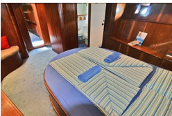
Single Occupancy Double Bed