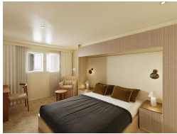
Ocean Twin Stateroom