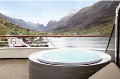
Prestige Stateroom Deck 4