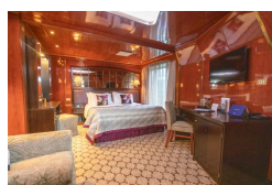
Premium Balcony Suites