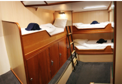
Triple Private - Waitlist