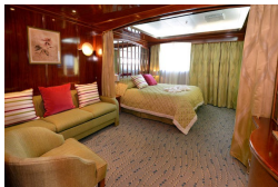
Byrd Deck Superior Sole