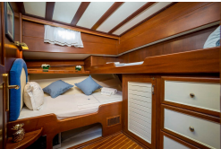
Full Ship Charter