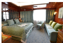
Mawson Deck Premium Suite