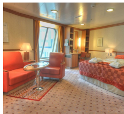
Polar Inside. From