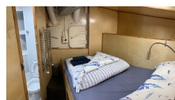
Twin / Double Cabin En-suite