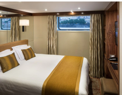
Category E Douro Deck 161 sq. ft. Suite Porto Deck, 323 sq. ft.