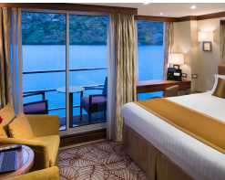
Category C Porto Deck 161 sq. ft. Category D Douro Deck 161 sq. ft.