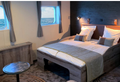
Triple Porthole Twin Deluxe