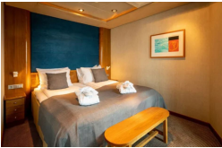
Polar Inside. From Polar Outside. From