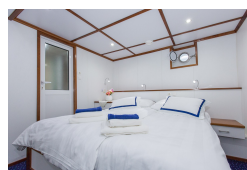
Upper Deck Cabin